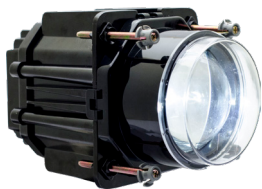
PM-710 Combo low and high beam