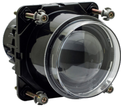
PM-707C/708C/709C low or high beam